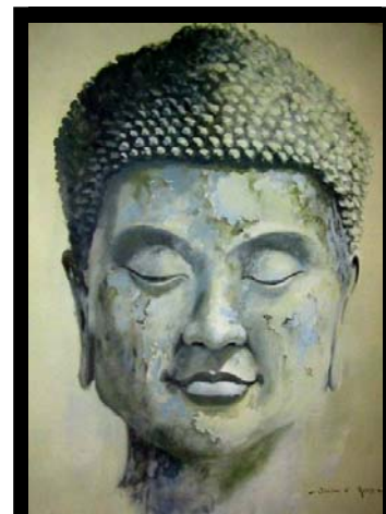
15: De-clutter and attract more.....everything!

By ridding yourself of what you don't need or use or even particularly like you are freeing yourself to attract .....?????..... abundance. Of what? Of everything or anything you're looking for. This is so important in the Eastern religions and Feng Shui. This can be so fulfilling and rewarding. Imagine going into your Kitchen Utensils drawer and actually seeing exactly what you have in the drawer because you've kept only one of three potato mashers. When you go to your bathroom cupboard to moisturize your body and have one bottle to choose from because you decided to use up your nearly empty, half empty and your travel bottles.